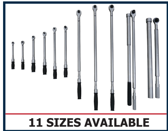
11 SIZES AVAILABLE